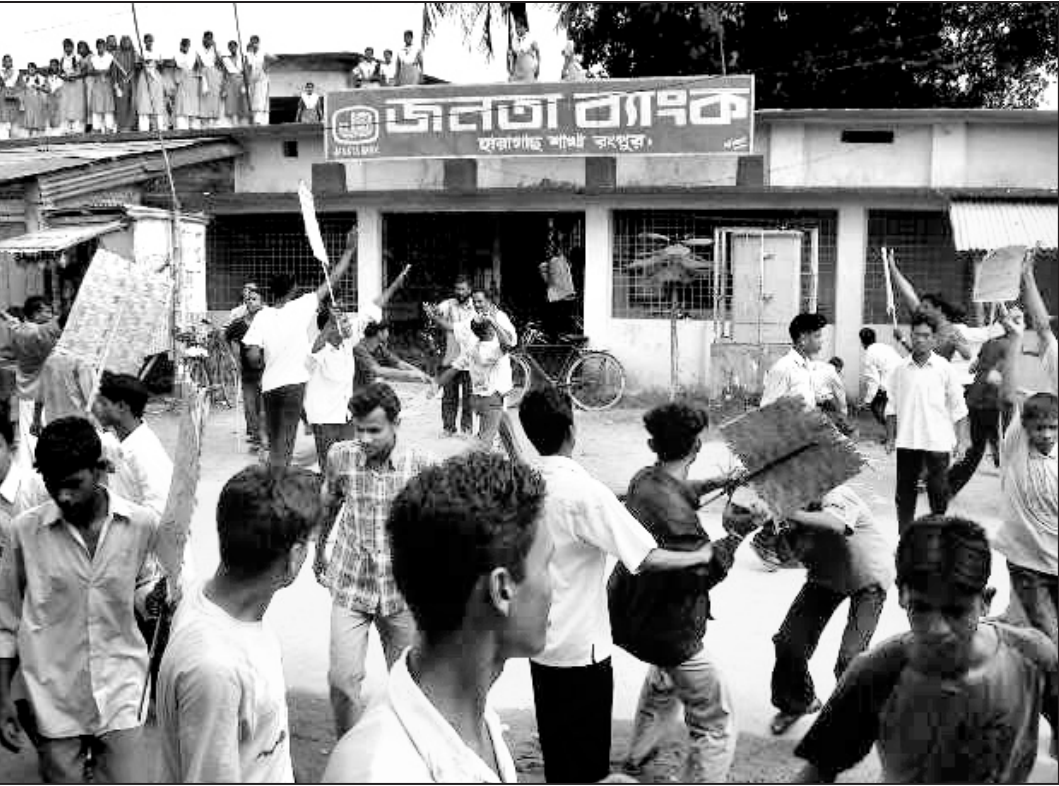
Agitated students demonstrating for smooth power supply in Haragachh took their wrath on the Janata Bank, pelting stones at it during a procession on Saturday.