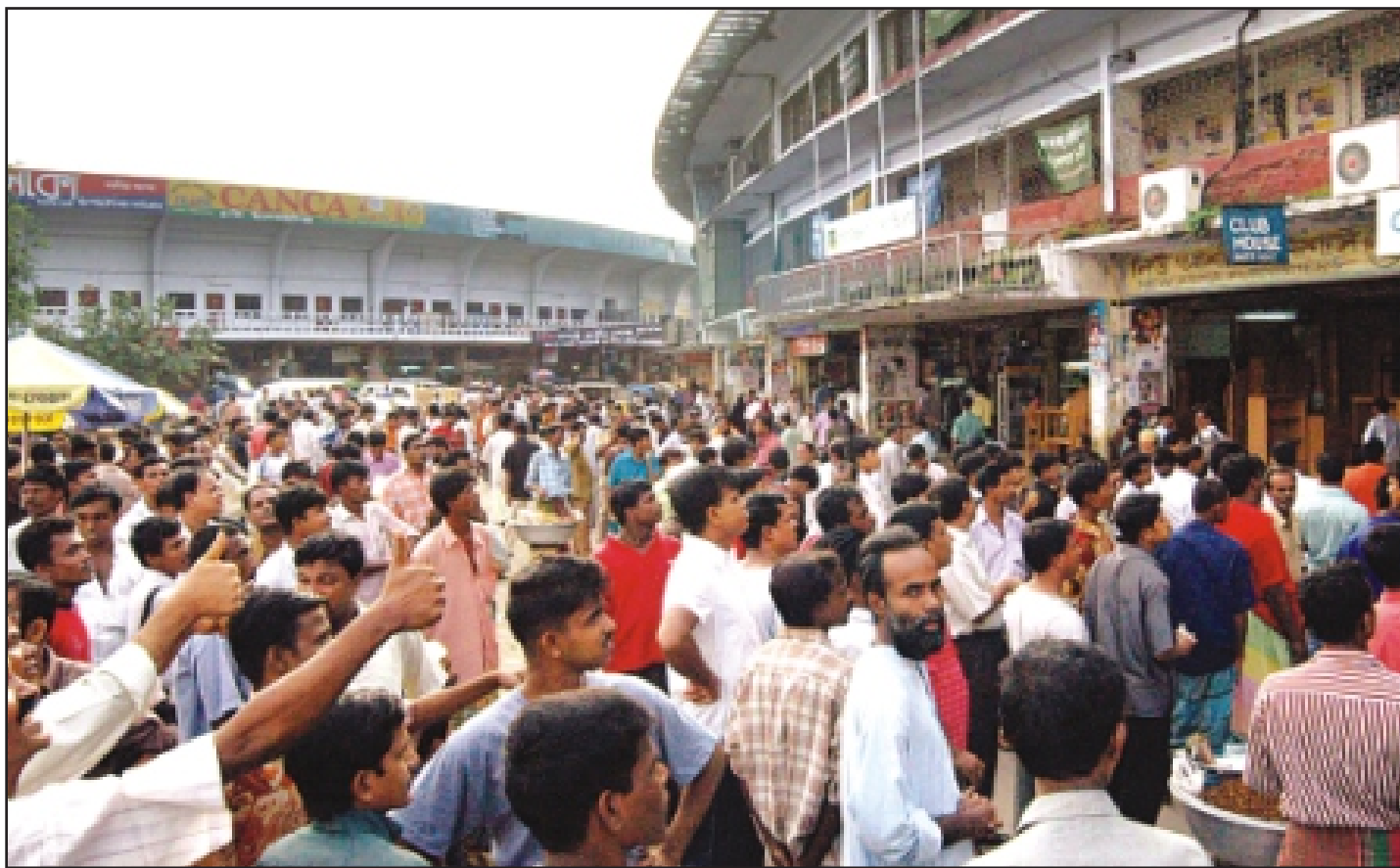
YOU MUST BE KIDDING! Spectators, who came to watch the Mohammedan-Farashganj match in the Premier Football League, demonstrate outside the Bangladesh Football Federation office at the Bangabandhu National Stadium on Saturday. The League was postponed only two hours before the start of the game.