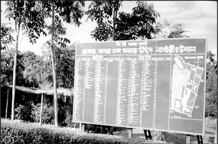
The 'central' nursery of herbal plants at Srimongol raised by Bangladesh Tea Research Institute (BTRI). It was set up with a view to supplying saplings to gardens under BTB's proposed project.

BDR and Police sources said, BDR jawans handed over them to Debhata police along with the seized the boat and fishing materials.