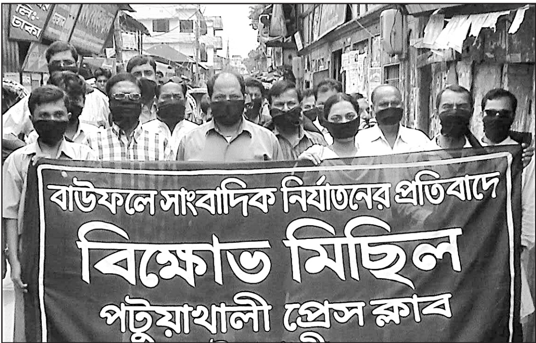
Journalists in Patuakhali, with faces covered with black cloth, brought out a silent procession in the town yesterday protesting torture of colleagues in Baufal and Borhanuddin.