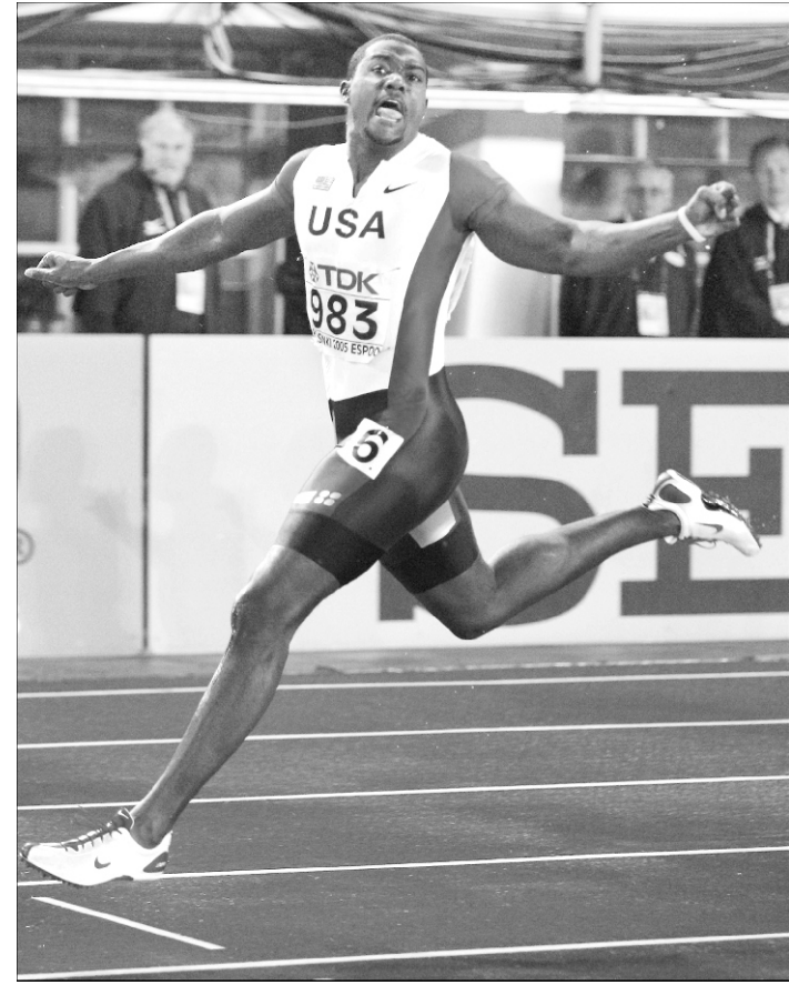
American Justin Gatlin celebrates after winning the 200m gold at the 10th IAAF World Athletics Championships in Helsinki on Thursday.