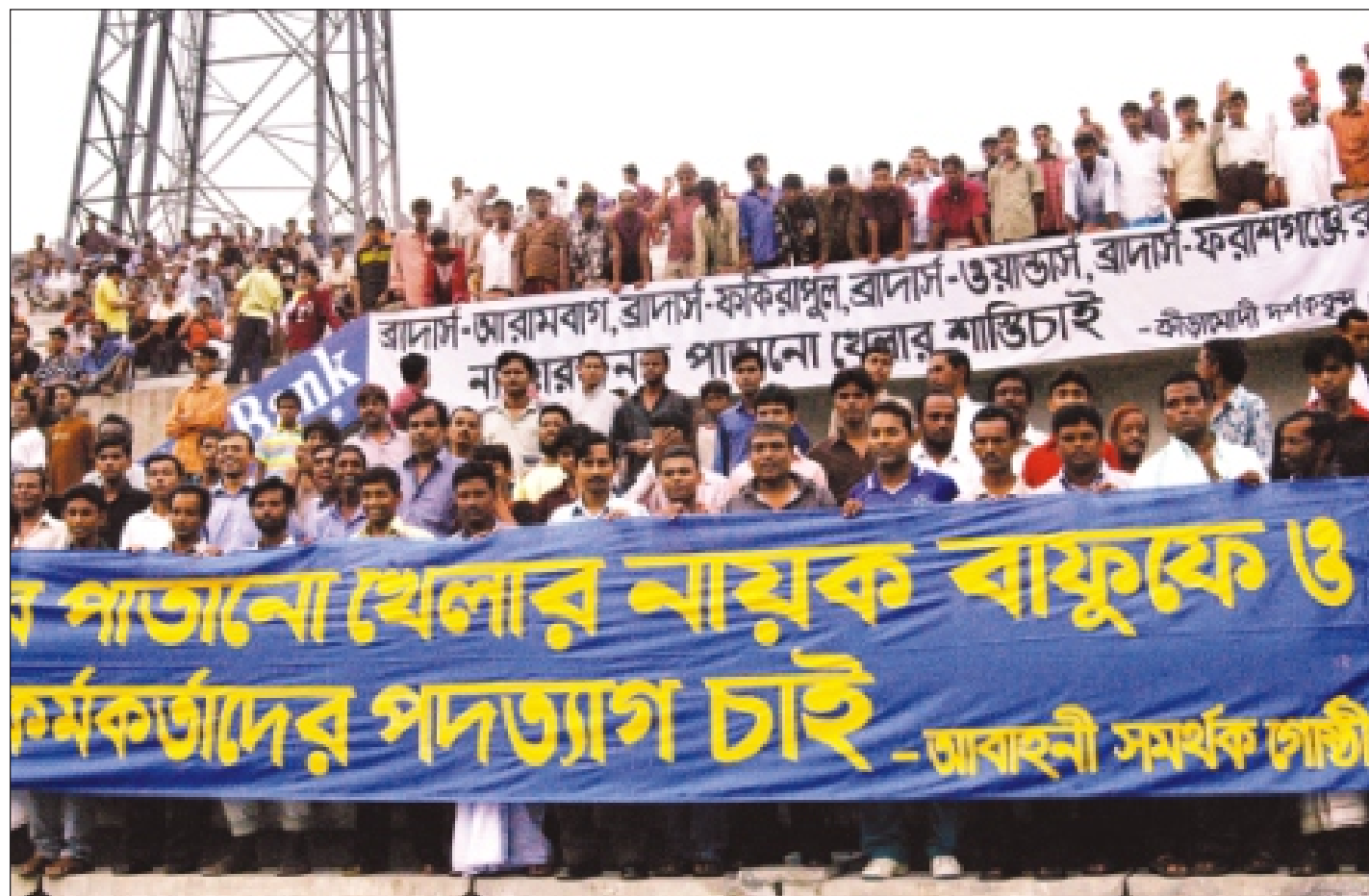
BITTER RIVALS UNITE FOR A CAUSE: A section of Abahani supporters stand inside the Mohammedan stands as both camps protest against alleged fixed matches in the ongoing Premier Division football league during the game between Youngmens Fakirerpool and Dipali Juba Sangha on Friday.