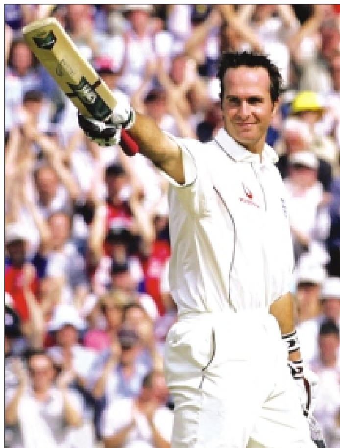
CAPTAIN ENGLAND: Michael Vaughan raises his bat after reaching his century on the opening day of the third Ashes Test on Thursday.