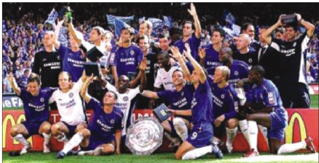
HERE WE GO AGAIN? Victorious Chelsea players after last Sunday's FA Community Shield final.