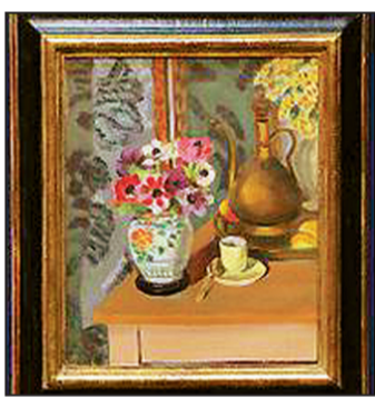
Nature morte, fleur et tasse by Henri Matisse