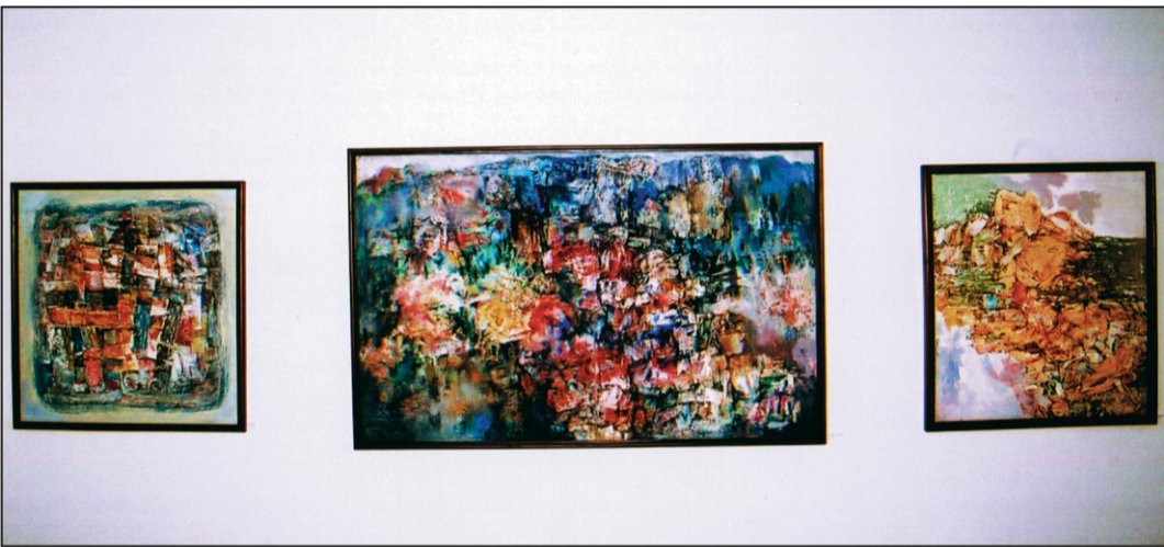
Paintings of Abu Taher at a recent solo exhibition