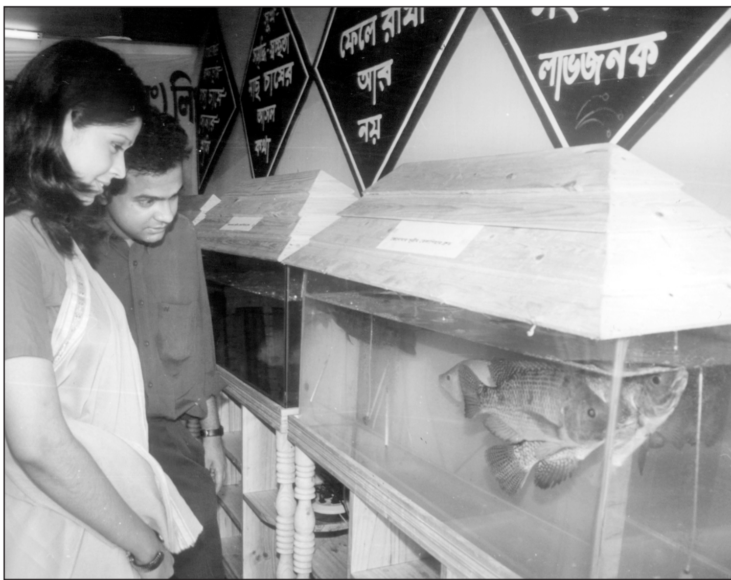
Visitors at a fish fair that began at the Shilpakala Academy in the city yesterday. Fisheries and livestock ministry organised the fair.

Relatives, friends and admirers have been requested to pray for the salvation of the departed soul.