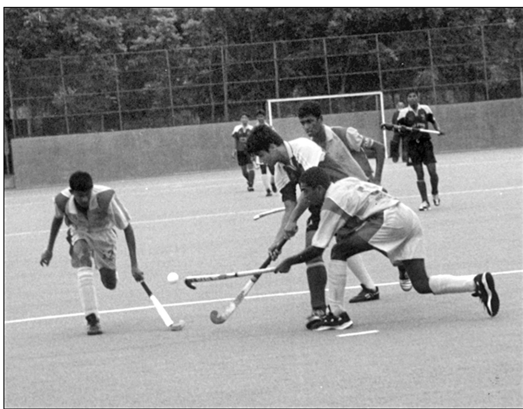
Action from Monday's match between Punjab and Sri Lanka in the North Bengal-CA Third BKSP Cup Invitational International Under-18 Hockey Tournament at BKSP.

(Austrian paceman) "I turned up expecting to have plenty of coffee and tea, and cake -- and end up playing in a Test match." On his inclusion in the team for the second Test after Glenn McGrath got injured.