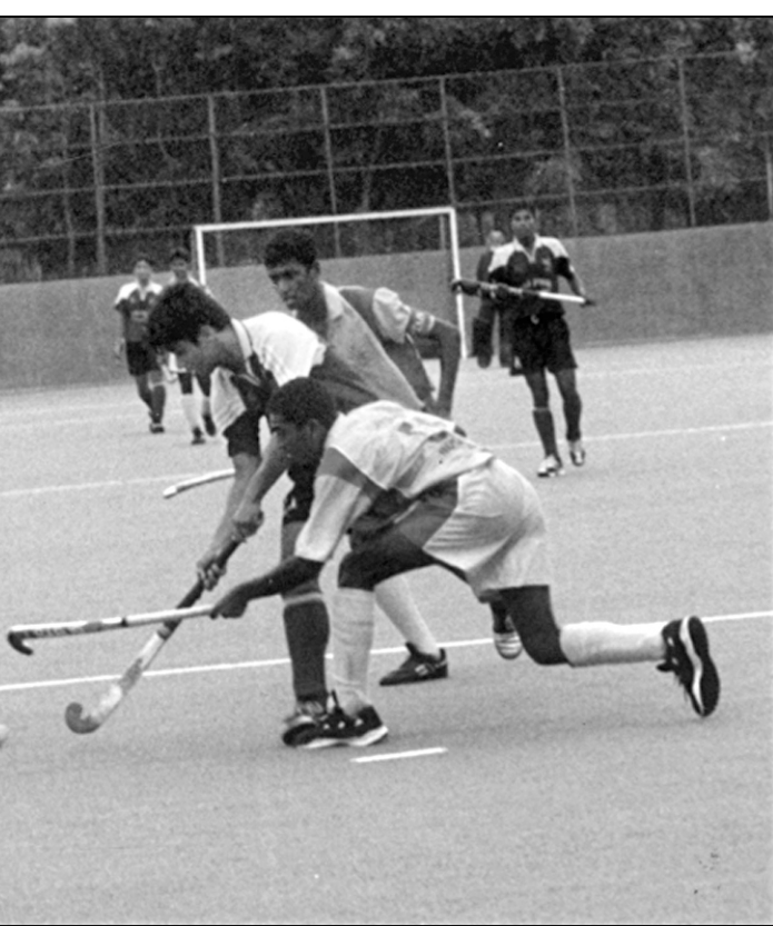
Action from Monday's match between Punjab and Sri Lanka in the North Bengal-CA Third BKSP Cup Invitational International Under-18 Hockey Tournament at BKSP.