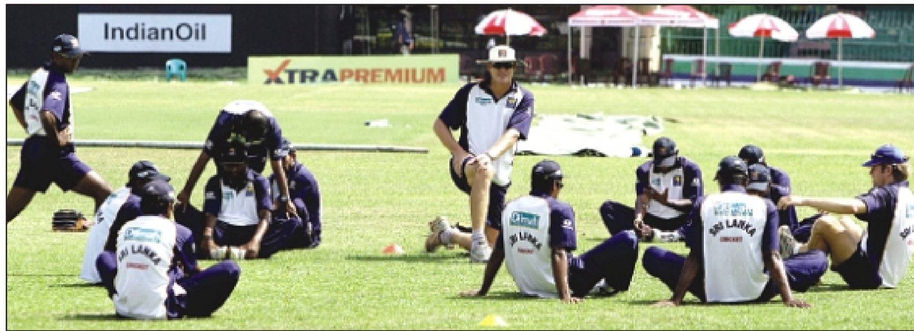
Sri Lankan cricket coach Tom Moody (C) demonstrates some stretching exercises in front of his players in Colombo on Monday.

SQUAD Marcusrescothick, Andrew Strauss, Michael Vaughan (captain), Ian Bell, Kevin Pieterse, Andrew Flintoff, Geraint Jones, Ashley Giles, Matthew Hoggard, Stephen Harmison, Simon Jones, Chris Tremlett.