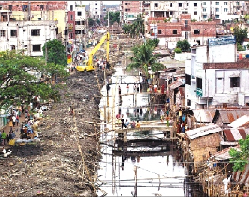
Waste and earth have been piled up on a road after re-excavation of a canal inside the DND (Dhaka-Narayanganj-Demra) Embankment. Water Development Board is conducting the canal clean-up drive in the area.