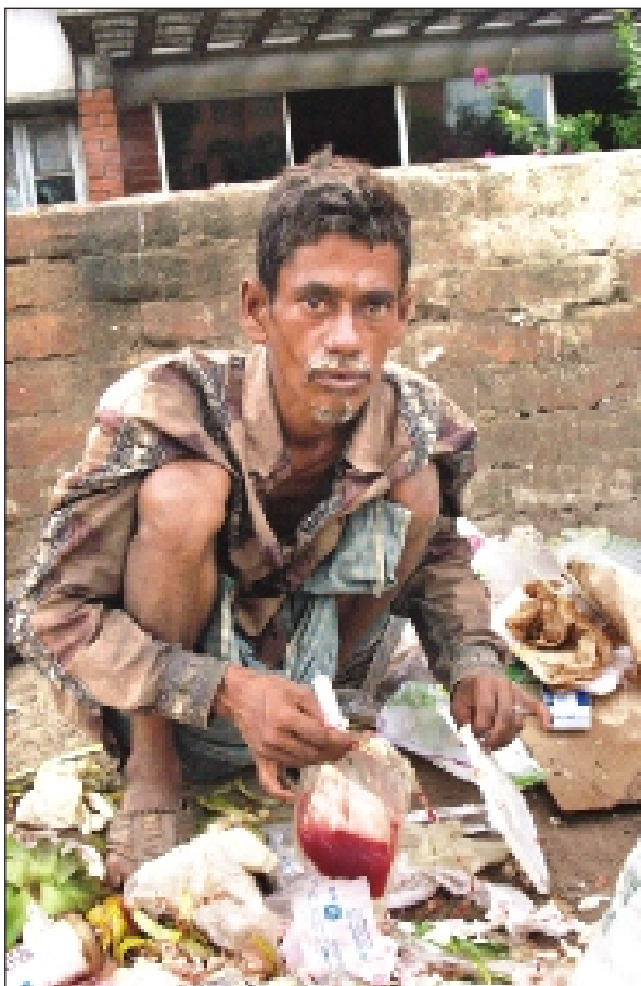
A man, left, collects used blood bags and syringes dumped in front of Suhrawardi Hospital; A pile of medical waste, right, on the premises of Pangu Hospital (National Institute of Traumatology and Orthopaedic Rehabilitation) in Dhaka.