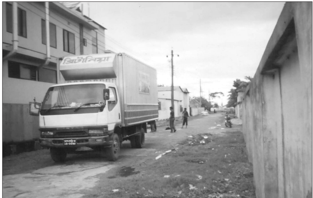
A truck loaded with finished goods going out of the Brahmanbaria BSCIC Industrial Estate.