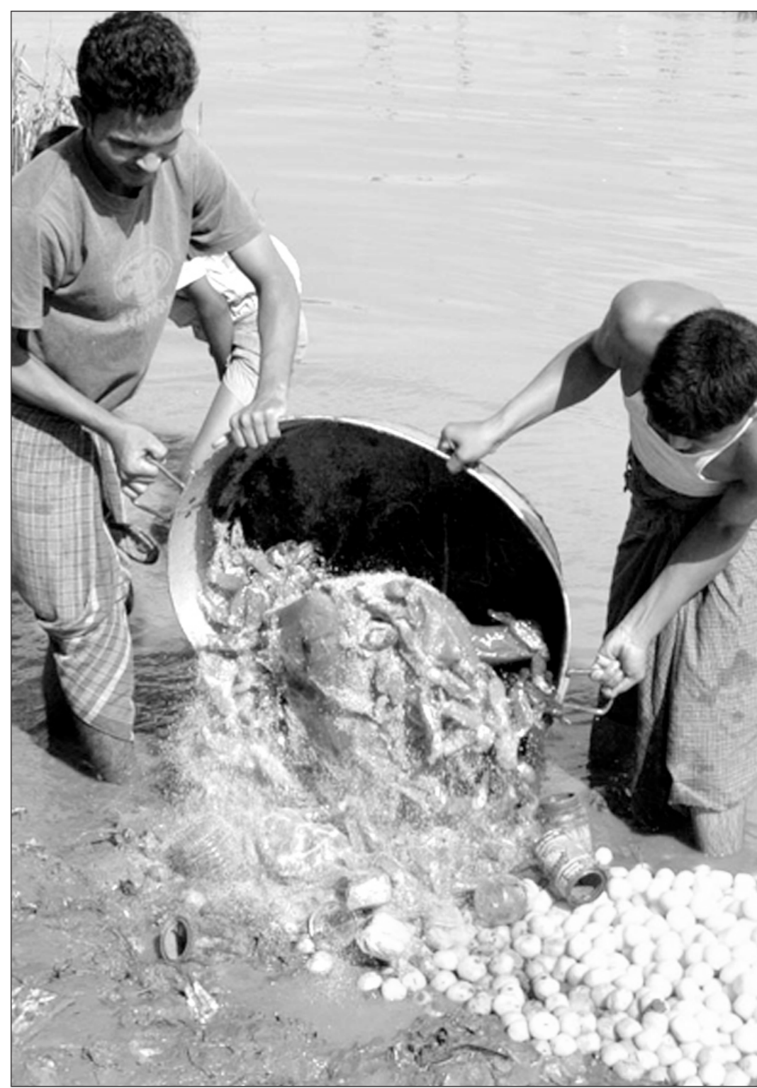
About 10 maunds of stale sweets produced at posh sweetmeat shop, Swad, were poured into the Karnaphuli river yesterday during a drive against adulterated food by the Chittagong City Corporation, launched as part of a country-wide programme.

Being informed, Comilla Katwali police took the bodies to Comilla Medical College Hospital for autopsy.