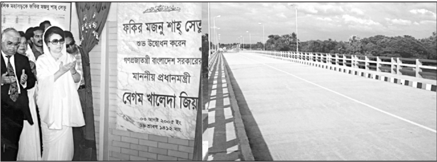
Prime Minister Khaleda Zia offers Munajat after inaugurating Fakir Majnu Shah Bridge over the river Shitalakhya at Kapasia in Gazipur yesterday.

mostly unknown and unnecessary books for the purpose -- ignoring essential and worthy books. No experts were consulted before preparing and finalising the list of books. The list was made reportedly with the suggestions of certain suppliers for their benefit. After a report was published in The Daily Star regarding the faulty selection of books, the education ministry stalled the project. When the ministry asked for a fresh bid after correcting the book list, a firm participating in the tendering process took the issue to court and the case has been pending since then.