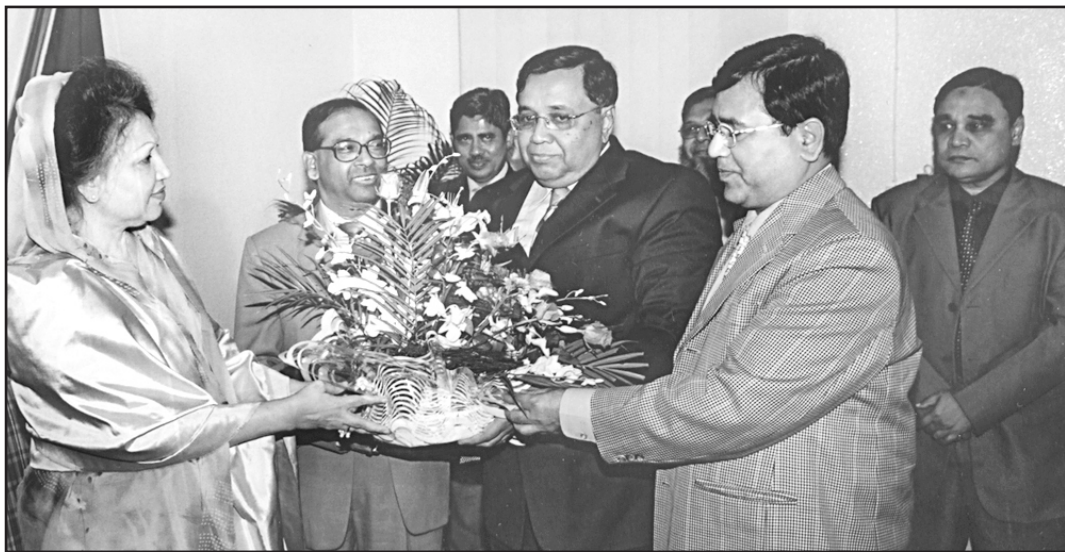
The newly promoted secretaries present a bouquet to Prime Minister Khaleda Zia at her office in the city yesterday.

She asked them to contact the PMO if necessary for performing their responsibilities properly.