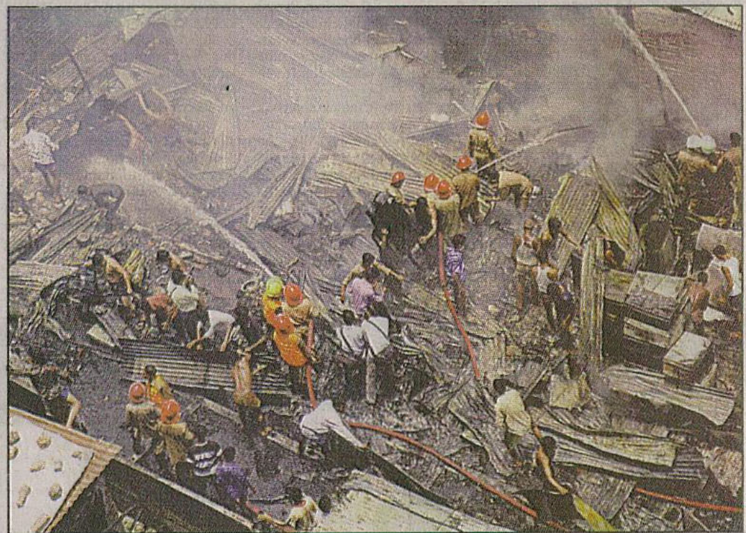
Fire Service and Civil Defence personnel with the help of locals fight a fire that burnt 30 tin-roofed houses and 14 shops at Karwan Bazar kitchen market in the capital yesterday.