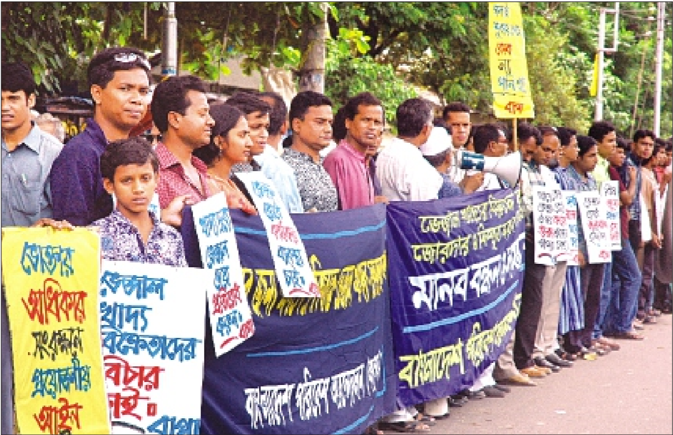
Bangladesh Paribesh Andolon forms a human chain at Shahbag in the capital yesterday, urging the authorities concerned to gear up the ongoing operation against adulterated food. A number of food stall owners and employees have been fined and jailed by mobile courts during their recent drives following newspaper reports.

Pakistan President Pervez Musharraf said yesterday that foreign students attending Islamic religious colleges in the country would be ordered to leave as part of a crackdown on militant groups. "They must leave. We will not issue visas to such people," he said in a meeting with Islamabad-based foreign media. The government estimates there are 1,400 foreigners studying at religious schools -- known as madrasas. Pakistani security forces have detained hundreds of suspected militants and Islamist clerics after a crackdown launched after the July 7 London bombings. Pakistan's latest crackdown came after revelations that three of the four suspected bombers in London were Britons of Pakistan descent and at least two of them had visited Pakistan recently. Asked how long the ongoing SEE PAGE 15 COL 6