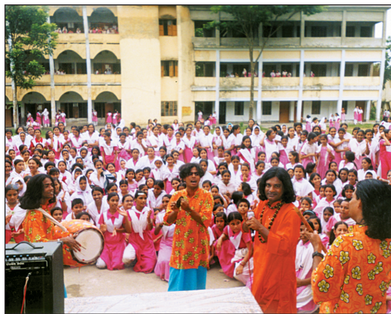
Baul singers perform at Barisal Government Girls School