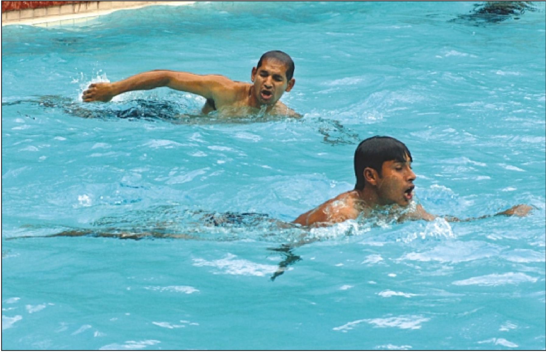
SWIM AWAY THE JET LAG! Bangladesh skipper Habibul Bashar (L), who joined the Tigers camp on Tuesday after returning from the USA the day before, takes to the pool at the Sonargaon Hotel where the cricketers had a swimming session.