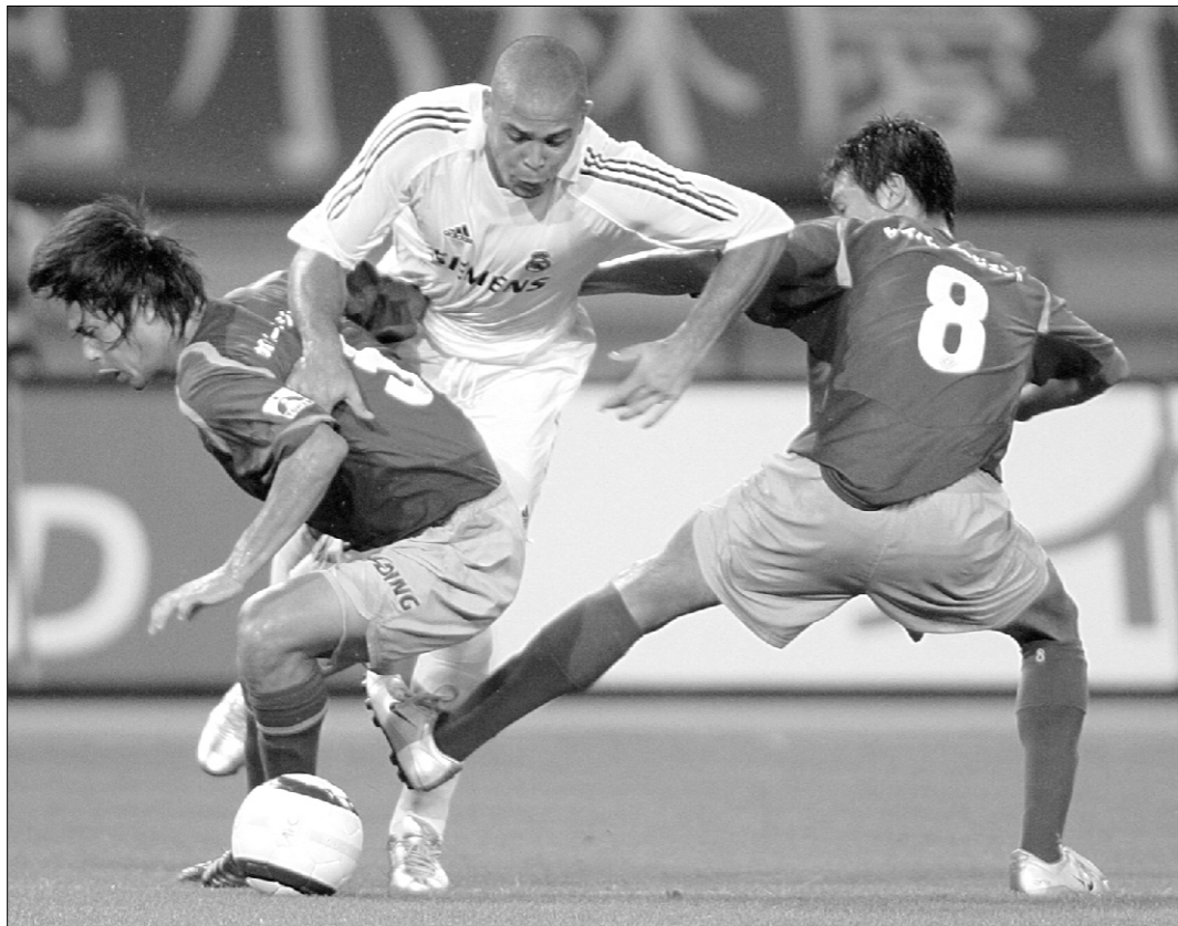
CHECKED! Ronaldo (C) is blocked by two Tokyo Verdy 1969 defenders at Tokyo Stadium on yesterday.