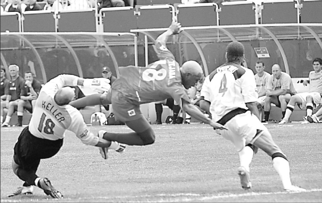
US goalkeeper Kasey Keller (L) sends Panamanian Luis Tejada (C) flying during the CONCACAF Gold Cup final at Giants Stadium in East Rutherford on Sunday.