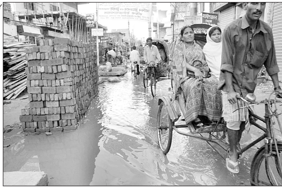
Authorities dug up a road at Maniknagar in the city to lay sewerage lines but left the work unfinished only to add to the sufferings of the people during the monsoon.