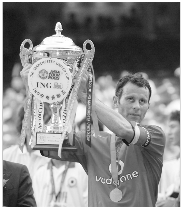
Manchester United's Ryan Giggs holds the trophy after the 2-0 victory over hosts Hong Kong yesterday.

The tour is also a chance for the Red Devils, who have courted Asia assiduously over the years with initiatives including a Chinese-language website, club shops, soccer schools and credit cards, to satisfy their legions of Asian fans.