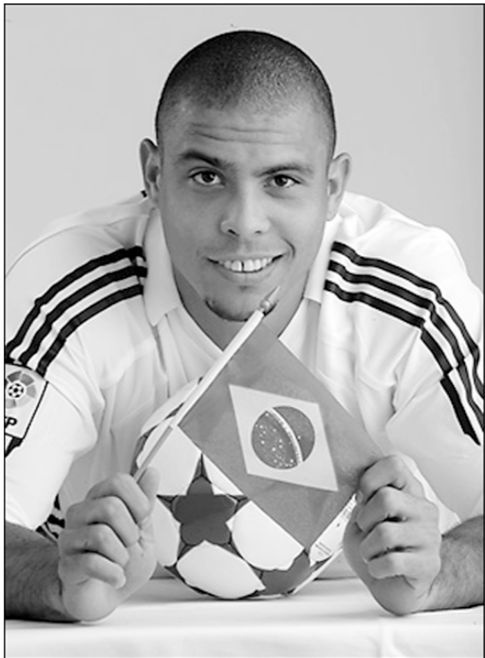
RONALDO LUIZ NAZARIO DE LIMA

If Ronaldo ends up winning another World Cup next year and captures a Champions League medal before his Real contract expires, there would be no better way to finish his career than a final victory stint in the US. At the very least, if he plays in the MLS, even at the end of his career, the last thing he'll be known as is 'underrated'.