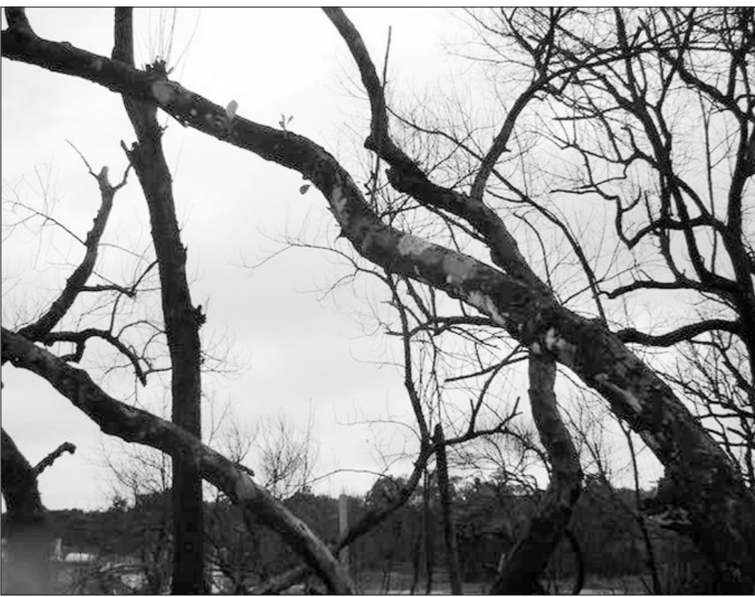
Greens destroyed by fire following blowout twice in Tenggratila gasfield area.

He said more than 75 per cent of irrigation water on fields is now misused or lost due to seepage, percolation and evaporation as farmers do not know the appropriate level of irrigation water and how to make best use of it.