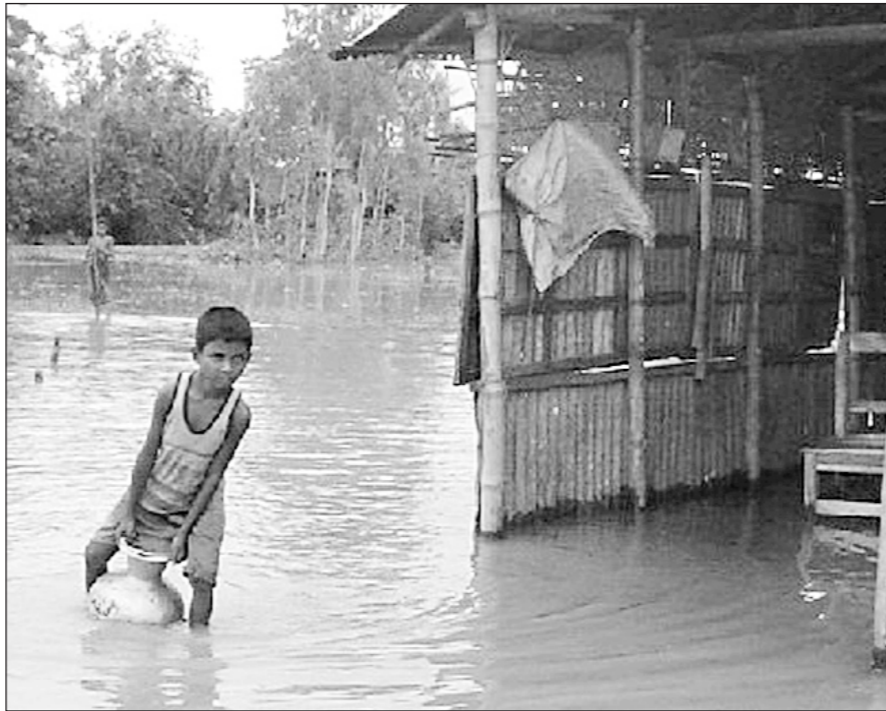
Flooded village in Kurigram (left) and a minor boy taking home drinking water at Kaiyaer Hat village in Fulchari upazila in Gaibandha district.