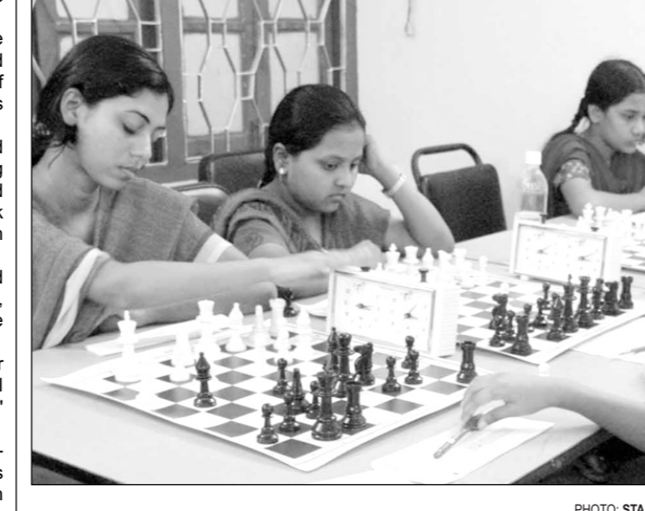
Scene from yesterday's first round matches of the Standard Chartered school chess tournament at the federation hall room.

series in 11 days' time. If England can keep the contest alive beyond that mark this time they may achieve something just as impressive as regaining the Ashes by keeping soccer off Britain's back pages even though the season will be underway by then. TEAMS ENGLAND: Michael Vaughan (captain), Marcus Trescothick, Andrew Strauss, Ian Bell, Kevin Pietersen, Andrew Flintoff, Geraint