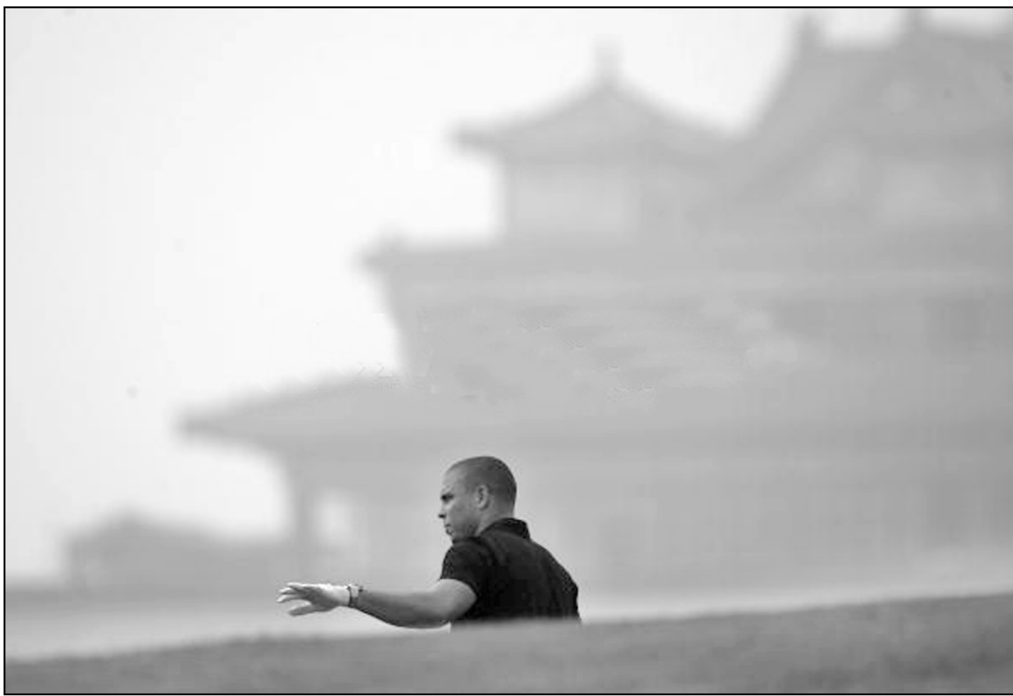
Real Madrid superstar Ronaldo rests while playing golf at the course of the team's hotel (in the background) in Xianghe county, some 52 kilometers southeast of Chinese capital Beijing. Real kick off their 4-day visit in China with a friendly match against Beijing Guoan at the Workers' Stadium on July 23 marking the 20th anniversary of the twinning of the cities of Beijing and Madrid.