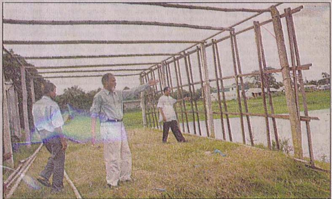
Zealots take away the tin sheets brought to build the roof and fence of an Ahmadiyya mosque at Dakkhin Khan, Uttara in the capital yesterday.