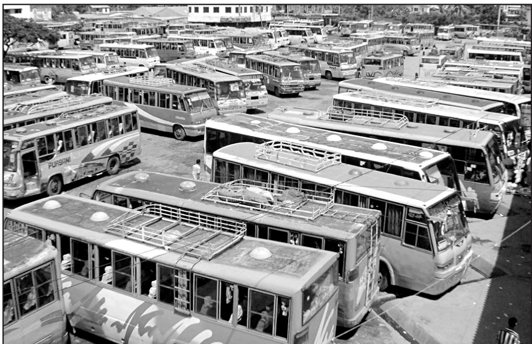
Long-route buses remain stranded at Bohaddarhat bus terminal in Chittagong as the Jute, Cotton and Textile Mill Workers' Sangram Parishad enforced a dawn-to-dusk hartal yesterday.