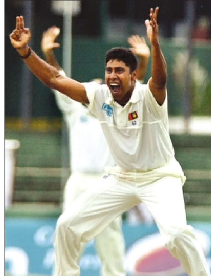
Sri Lankan fast bowler Chaminda Vass successfully appeals for a lbw decision against West Indian batsman Dwayne Smith on the third day of the first Test at the Sinhalese Sport Club ground in Colombo yesterday.