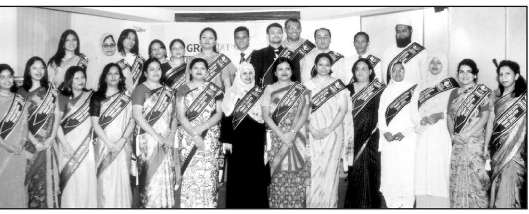
The participants of Aga Khan School graduation ceremony pose for photograph at the Brac Centre auditorium in the city recently.