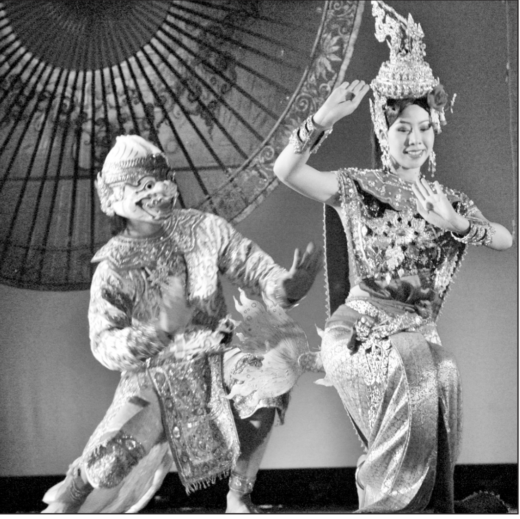
Shun-Nga Group, a dance troupe from Chiang Mai, Thailand, performs at the National Theatre Stage at Shilpakala Academy in the city yesterday. The event was part of the 11-day Thailand Festival-2005 that began in the city on Thursday. The Royal Thai Embassy in collaboration with Thai Airways International and Sonargaon Hotel organised the festival.