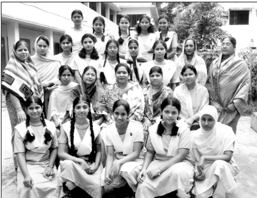
The achievers of GPA-5 in this year's SSC examinations from Ispahani School and College pose for photograph with their teachers.