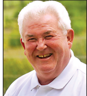
David Shepherd (Former English cricket umpire) "I felt very flattered. But I didn't want it really. There's enough hype going on these days. Players are the stars. The game of cricket is for players not umpires." When he was requested to officiate in the Lord's Test.