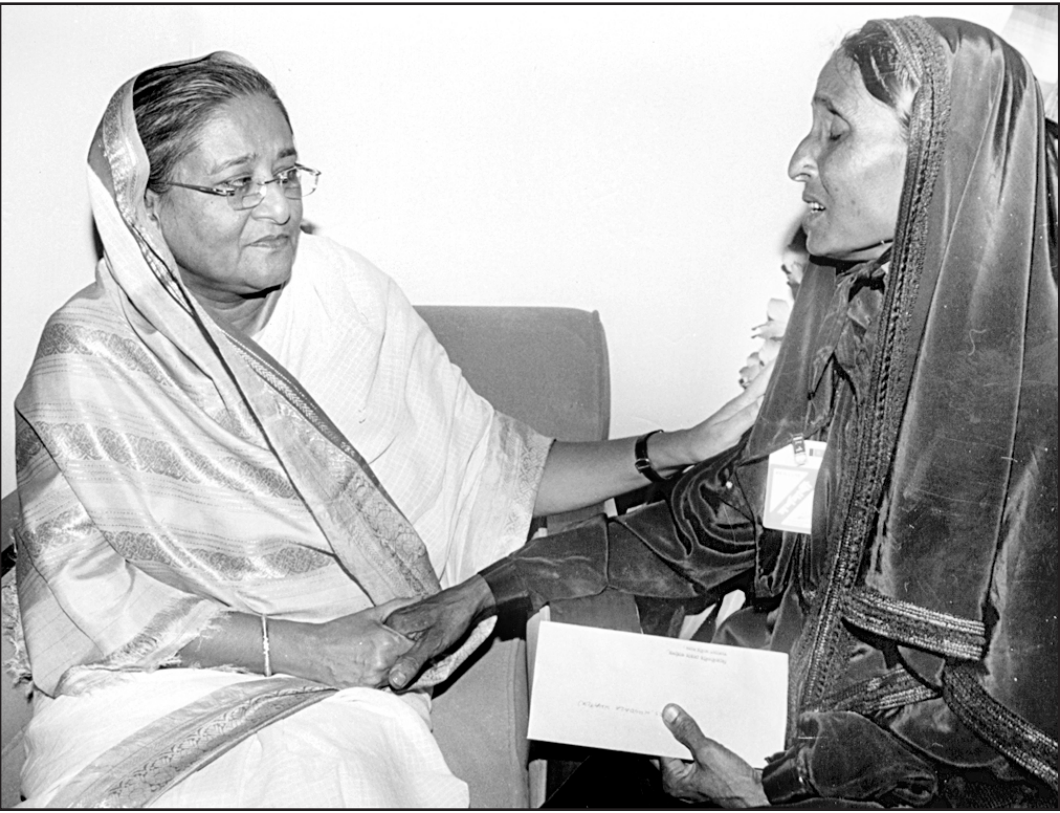
Leader of the Opposition in Parliament Sheikh Hasina consoles the wife of a victim of Habiganj grenade attack and gives financial assistance to her in the city yesterday.