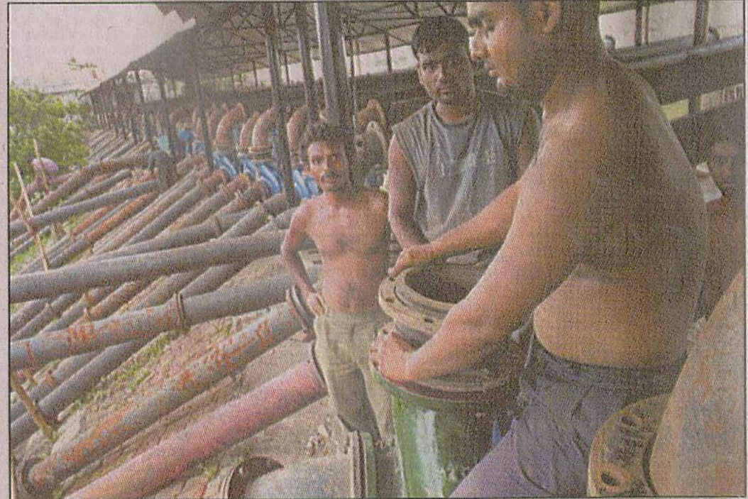
Workers install a pump at a sluice-gate near Rampura Bridge in the capital yesterday to pump out floodwater.