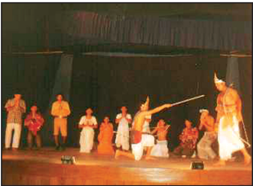
A scene from Bajao Panchajanya