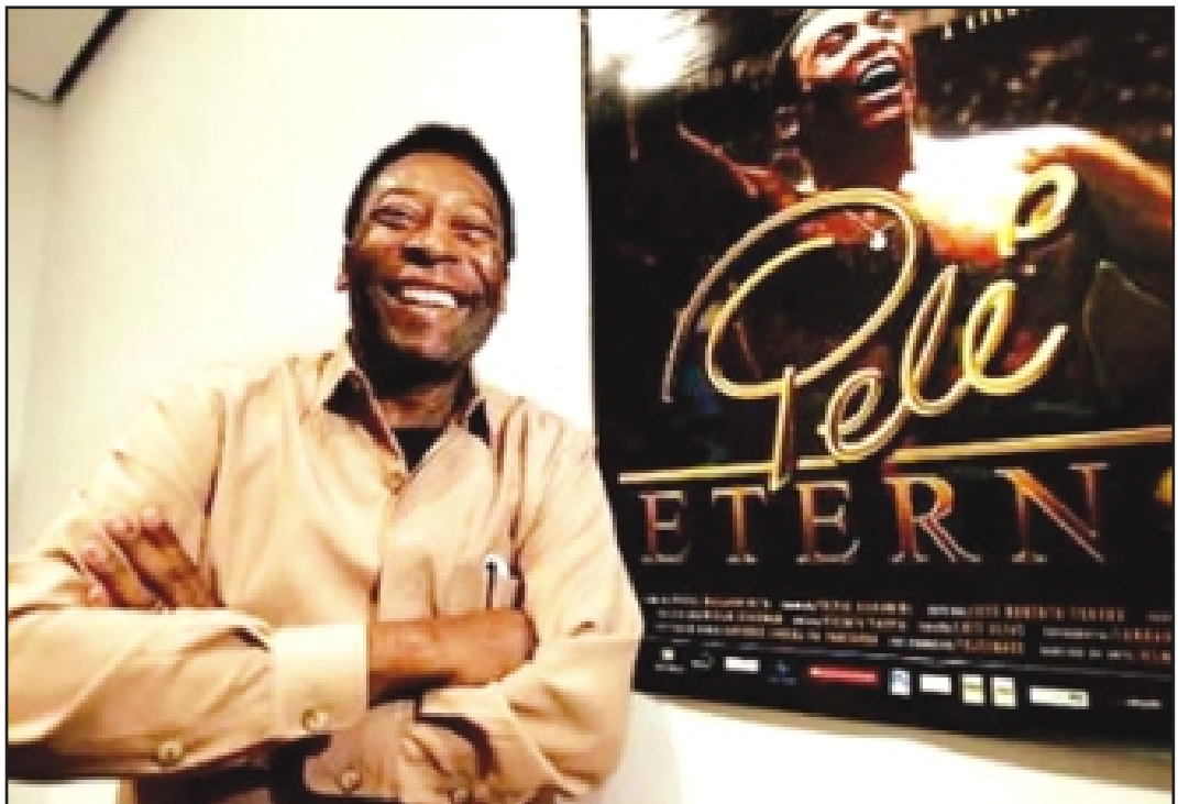
Football legend Pele poses next to a poster for a documentary film titled 'Pele Forever' at New York's Museum of Modern Art on July 8.

Javed Miandad (Former Pakistan cricket captain) "I'm disappointed. It is no use playing a cricket series when a visiting team is refusing to play in Karachi despite security assurances from the board and government." After England's refusal to play Test in Karachi.