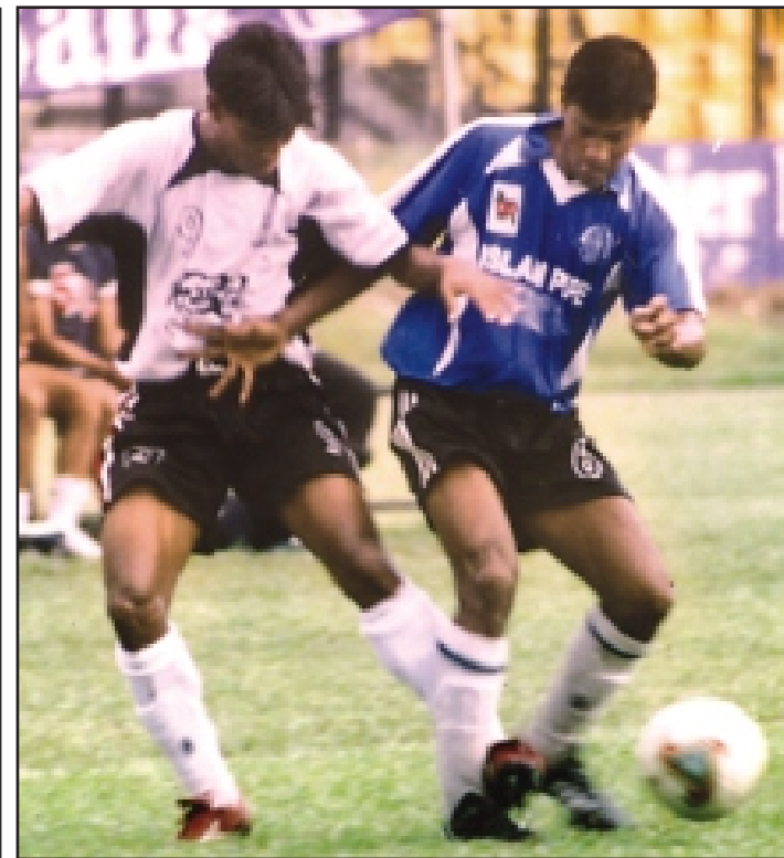
Action from yesterday's Premier Bank Premier Division Football League clash between Arambagh and Dhaka Wanderers at the Bangabandhu National Stadium.