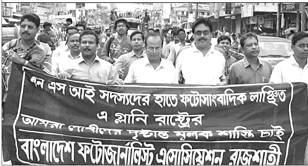
Journalists brought out processions yesterday in Mymensingh town (top) and Rajshahi city protesting Thursday's atrocious attack on working photojournalists by NSI men in Dhaka.