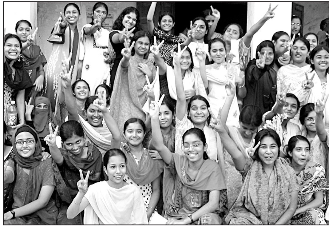
Eighty-one out of 218 students of Bogra Government Girls High School secured GPA-5 in this year's SSC Examinations. The results were published yesterday.

Every year, hundreds of landless people leave homes for work elsewhere.