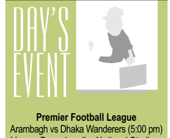
enue: Bangabandhu National Stadium

During the opening ceremony of the Olympic Games, the procession of athletes is always led by the Greek team, followed by all the other teams in alphabetical order (in the language of the hosting country), except for the last team which is always the team of the hosting country.