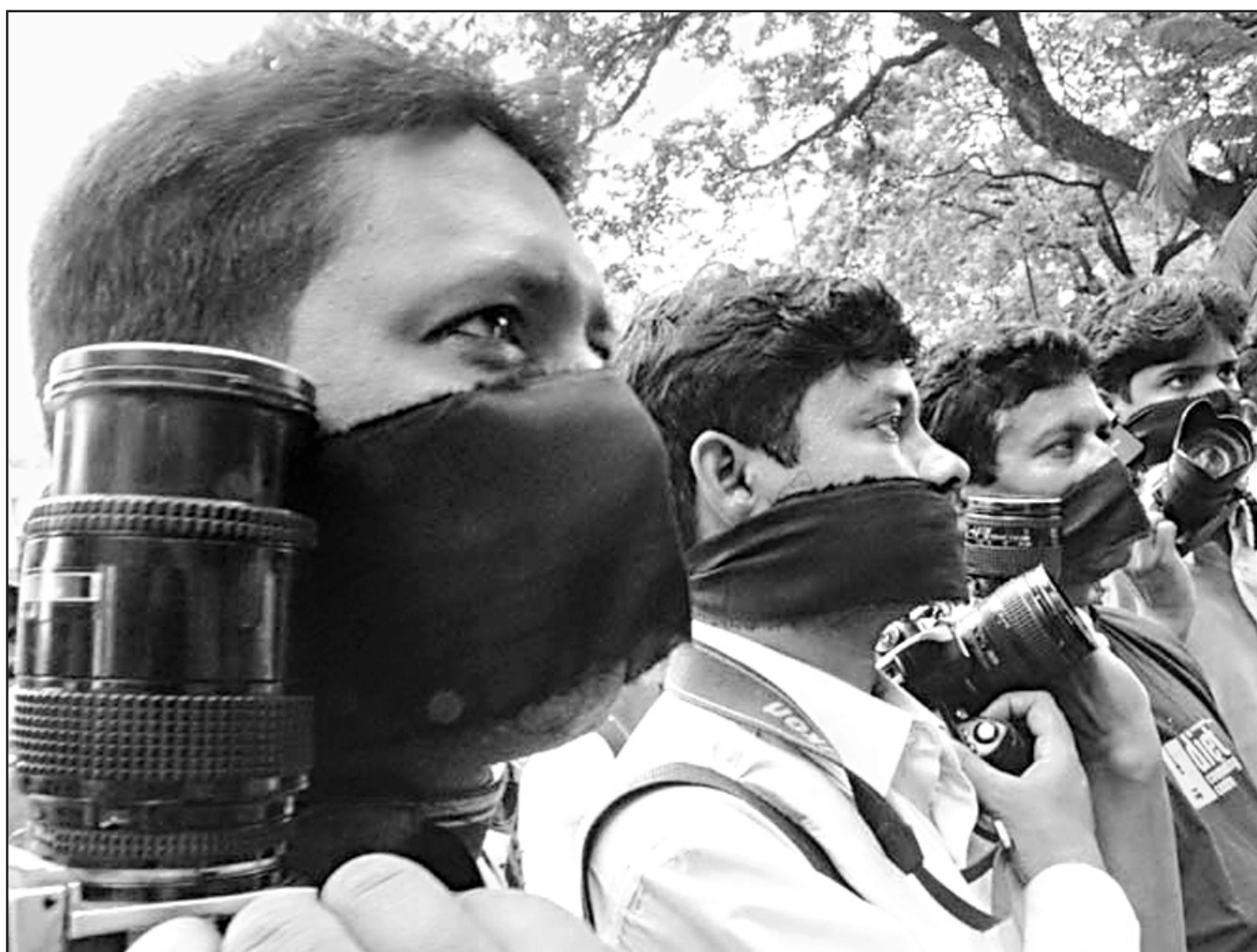
Covering their faces with black cloths, photojournalists stage a demonstration in front of the National Press Club in the city yesterday protesting assault on their colleagues by the National Security Intelligence (NSI) men on Thursday.