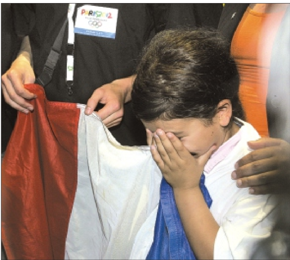
DELIGHT FOR LONDON, DESPAIR FOR PARIS: (L) Londoners celebrate their city's winning the 2012 Olympic Games at Trafalgar Square while (R) a French schoolboy, who was part of the bidding team, in Singapore breaks down upon hearing his country's failure in the IOC voting on Wednesday.