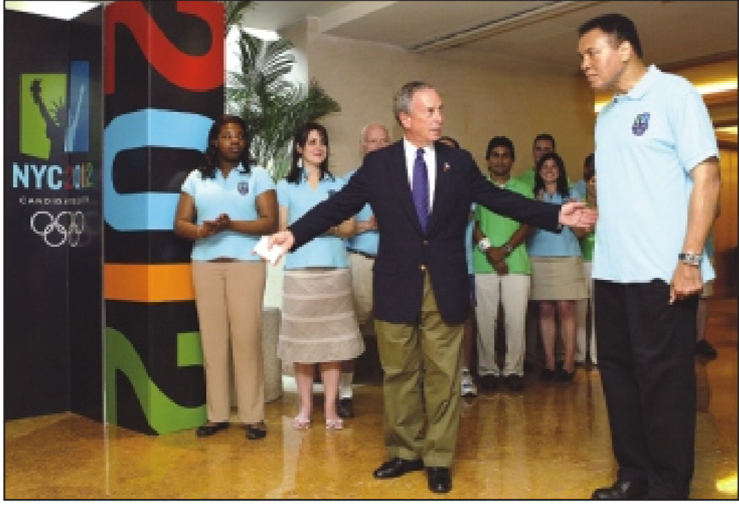
WELCOME TO NEW YORK: Legendary boxer Muhammad Ali is received by New York City mayor Michael Bloomberg at the Ritz-Carlton hotel on Tuesday, a day before the IOC votes in Singapore who will earn the right to host the 2012 Games.

Justice Sachs would decide on the format and timeframe for the hearing and his decision would be final, the statement said.