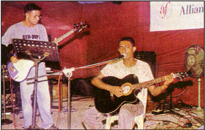
Students of Alliance Francaise performing a song

This celebration was first launched in France in 1985. This was to bring together all music loving people and not just professionals. Music came out of the French cocoon of a national celebration and combined tunes and notes from other cultures too.