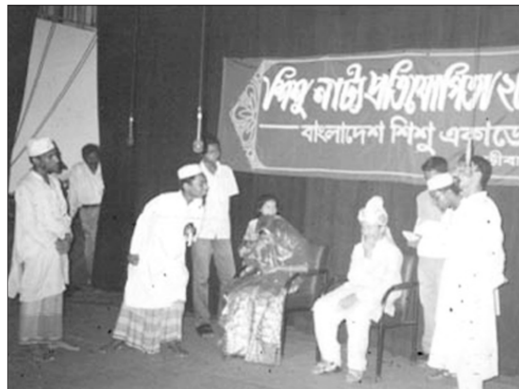
Sequence of a drama staged during the children's festival held in Moulvibazar.