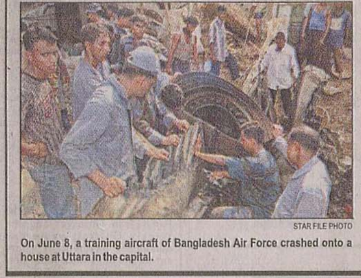
On June 8, a training aircraft of Bangladesh Air Force crashed onto a house at Uttara in the capital.

STAFF CORRESPONDENT Fifty-eight people died so far in four of the nine air crashes in the country since independence. The latest accident occurred in Chittagong yesterday as a DC-10 aircraft from Dubai with 201 passengers and 14 crew skidded off the runway. According to official sources, the Biman flight BG-048 that left for Dhaka via Chittagong at