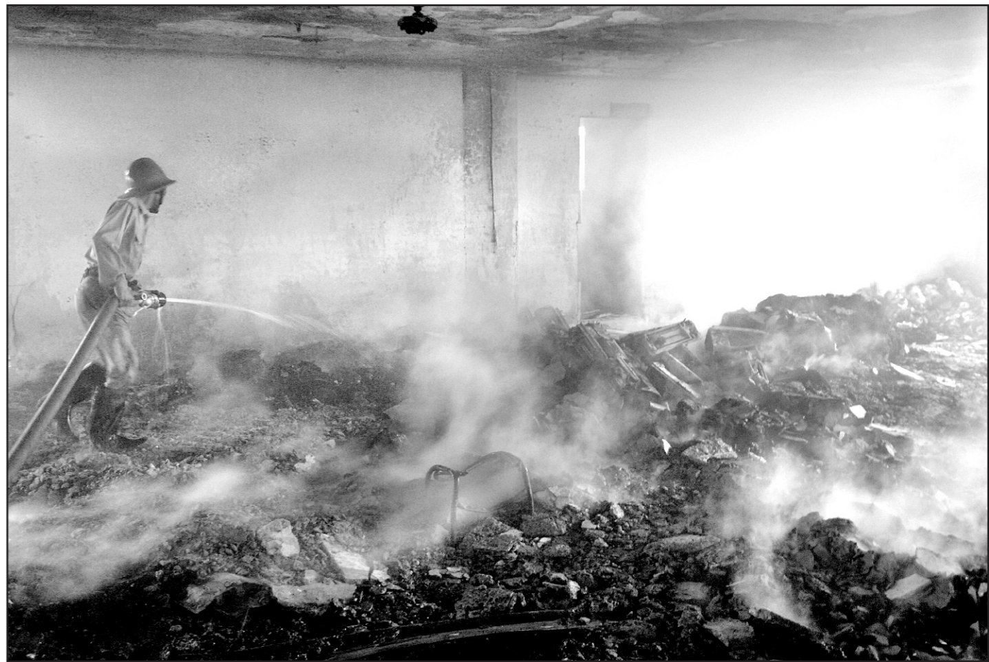
A six-storey export-oriented Biswas Textile and Garments Factory in Savar was damaged in a fire yesterday.

The UK unit leaders greeted her for receiving honorary doctorate degree from the prestigious People's Friendship University of Russia and her role in the conference of Association of Asian Parliaments for Peace (AAPP), in Strasbourg, France.