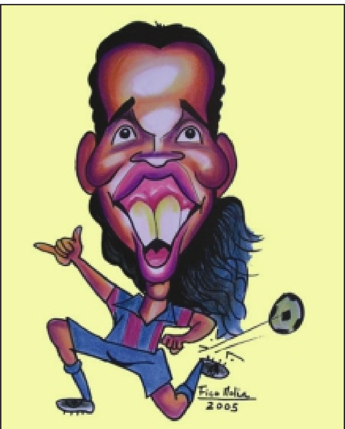
FOOTBALL IS FUN AND SO IS RONALDINHO

RONALDINHO (BRAZIL): The World Footballer of the Year said he was tired before the tournament and has looked it at times, especially when caught in Mexico's defensive straitjacket. Yet even when not at 100 percent, the Barcelona superstar remains the beat at the heart of Brazil - both on the pitch and in the team's hotels where he signals the team's arrival on a drum. Ronaldinho has seemed happy at this tournament to take a back seat to the new star of Brazilian football, Robinho, but in a game in which the traditional South American pride at stake is just as important as the trophy, he has all the attributes to conjure up the match-winning goal.