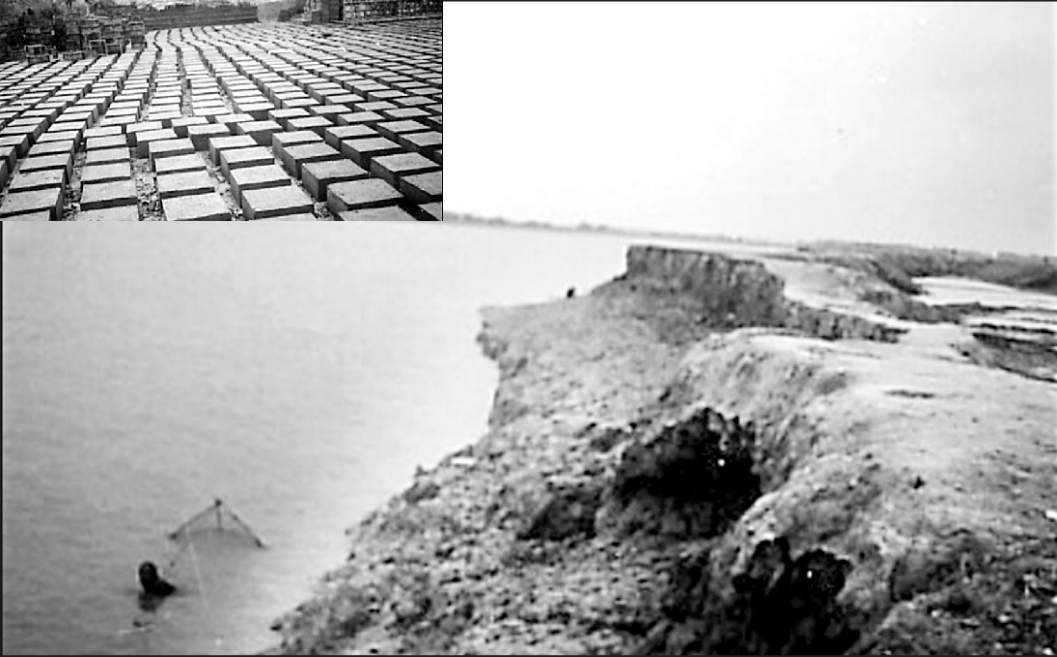
Concrete blocks being made allegedly disregarding specification (inset) and continued erosion by Kobadak river in Gabura in Satkhira district.