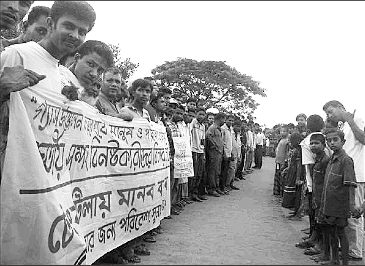
Different organisations form a human chain in Tengratila yesterday demanding trial of the persons responsible for the gasfield blowout.