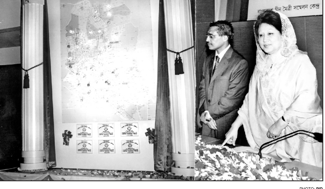
Prime Minister Khaleda Zia inaugurates six police stations under Dhaka Metropolitan Police (DMP) at Bangladesh-China Friendship Conference Centre in the city yesterday.

In their separate messages of felicitation, lajuddin and Khaleda hoped that the fraternal relations existing between the countries would "continue to develop, strengthen and deepen in all areas of cooperation in the days ahead under his able leadership."They wished him good health and personal wellbeing. They also sought continued peace, progress and prosperity of the brotherly people of the Islamic Republic of Iran