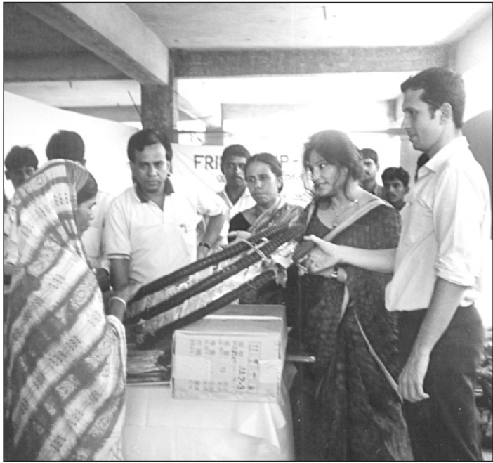
Friendship, an NGO, distributed sewing machines and vans to the family members of the victims of Savar garments factory tragedy recently.