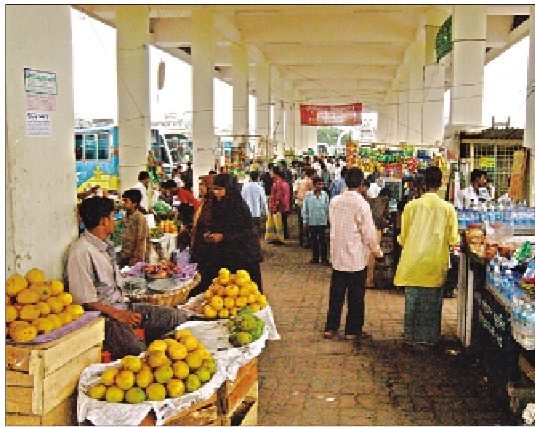
A group of influential people has set up makeshift shops at the renovated Mohakhali inter-district bus terminal in the capital.