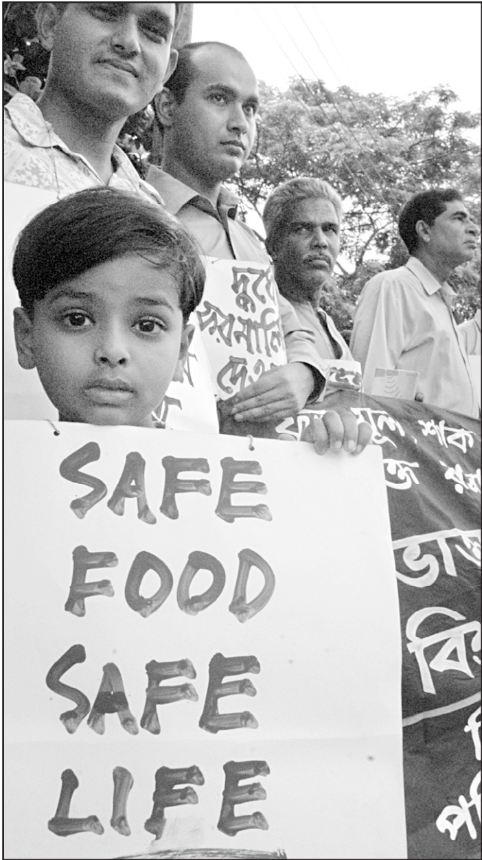
Paribesh Bachao Andolon (Save Environment Movement) forms a human chain at Shahbagh in the city yesterday demanding effective measures to check mixing of toxics with food and maintain the quality of food.