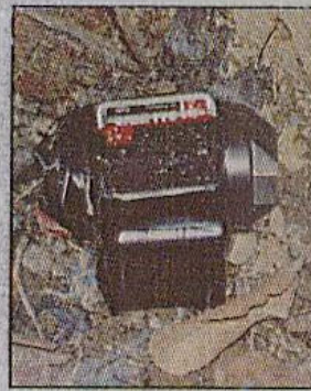
Recovered live bomb, left, and an Ahmadiyya mosque after an arson attack damaged it.