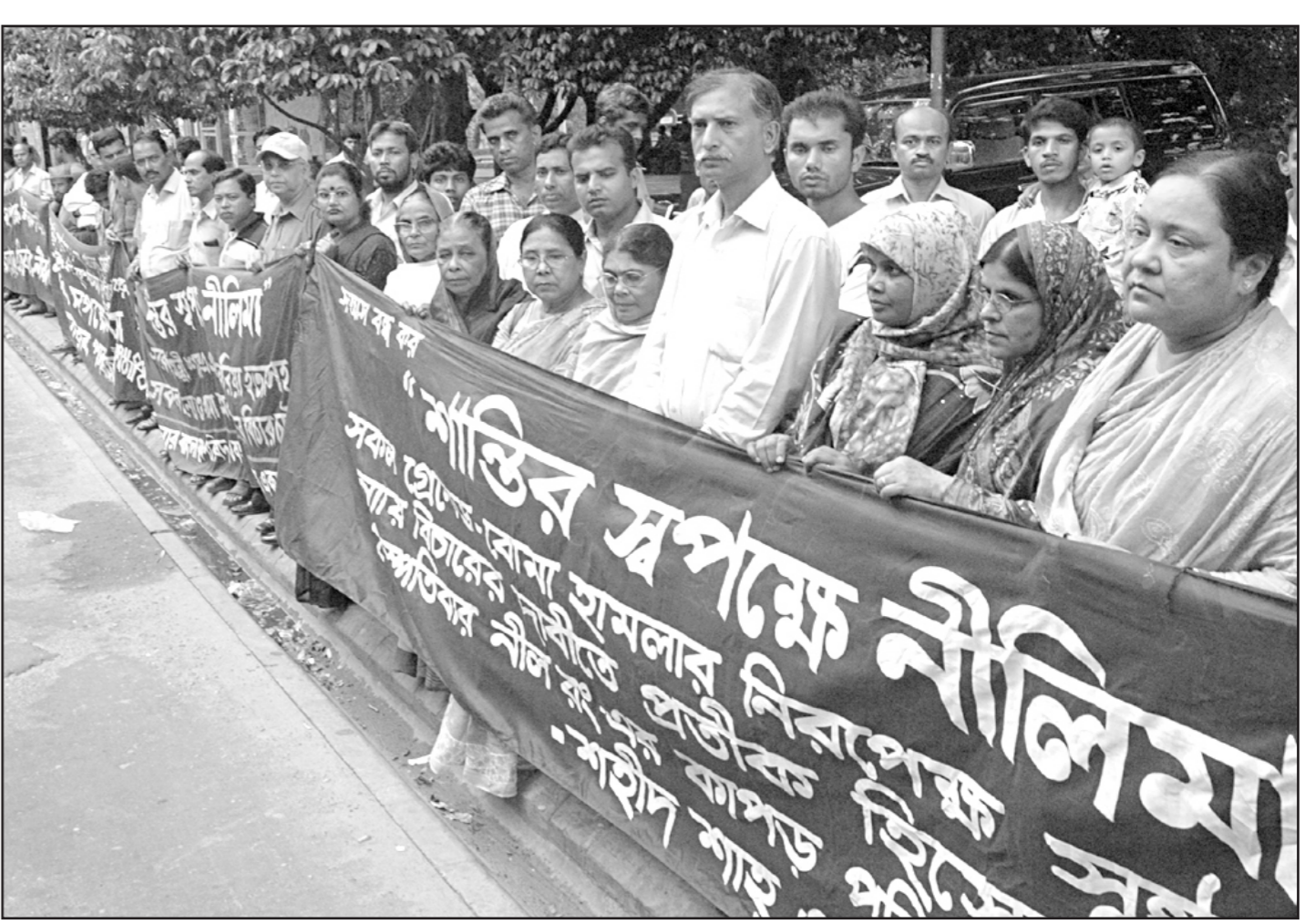
'Blue for Peace' was observed at Dhanmondi in the city yesterday demanding fair investigation into the incidents of all grenade attacks. The family members of former finance minister Shah AMS Kibria organised the programme.