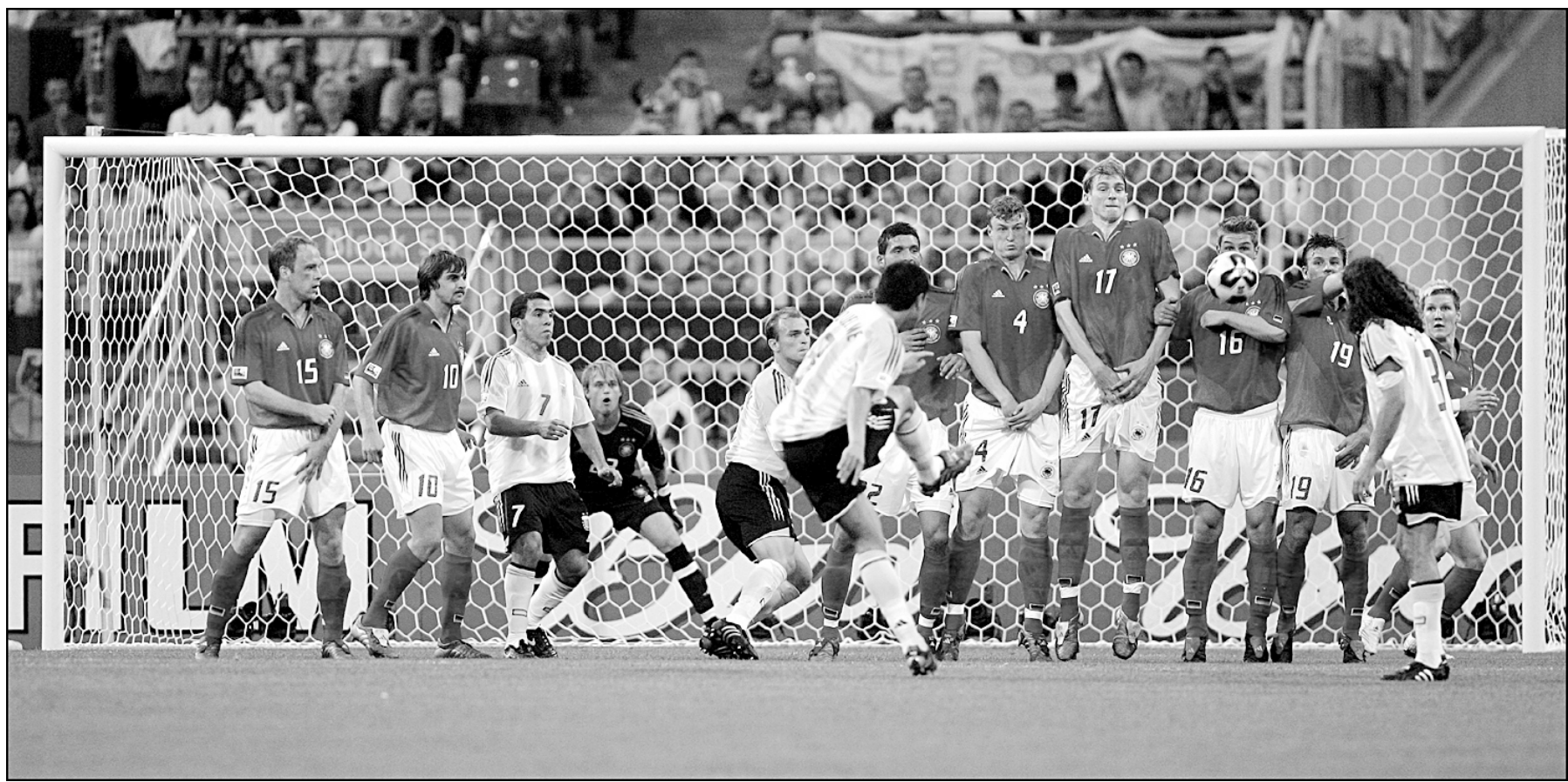
Argentina's star midfielder Juan Riquelme (C) curling a freekick over the German wall to scores at the Frankenstadion in Nuremberg on Tuesday.

"He is a real handful and hardly gives the ball away. We have to learn to concentrate all the time when players like Riquelme are in the opposing team."